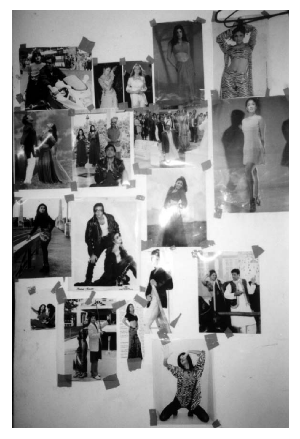
FIGURE 1 A montage of costumes at a 'filmi' tailor's workshop. Most photographs are of actresses in revealing ghaghara-colis (skirt and bodice). These kinds of costumes are deliberately tailored to enhance characteristics like breasts and hips.