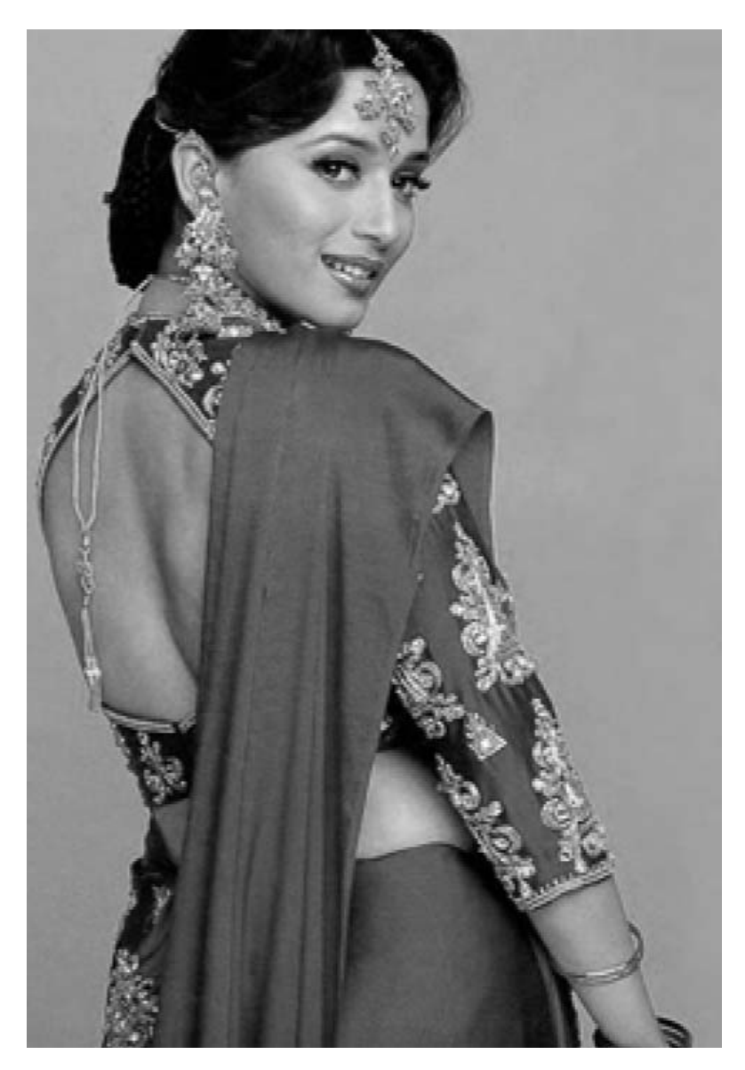
FIGURE 4 Actress Madhuri Dixit in her famous lehnga from Hum Aapke Hain Koun . Although the dress is stylistically Indian, it acquires a 'filmy' glamour from the exposure of the wearer's back. (Eros International).

I remember how my friend got red lace material, and stitched it the same way as Madhuri's dress (showing the pic. [sic] to the tailor). It was the talk of the college when she first wore it!