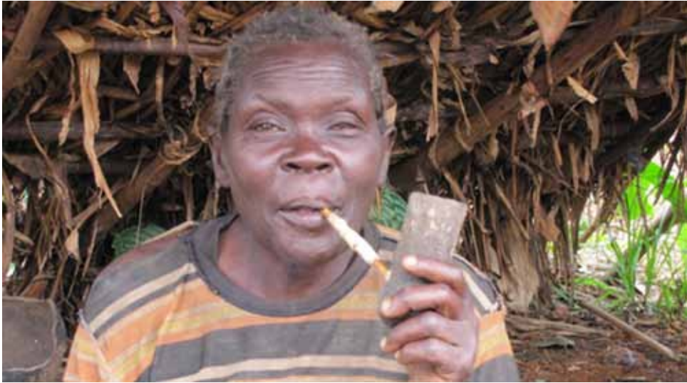
Figure 3 Elderly woman that plays role in conflict resolutions

events. Some elders are highly respected for their knowledge or other abilities but they have limited influence over others. Women are said to play a major role in conflict resolution (see Figure 3) (Garfield, personal communication).