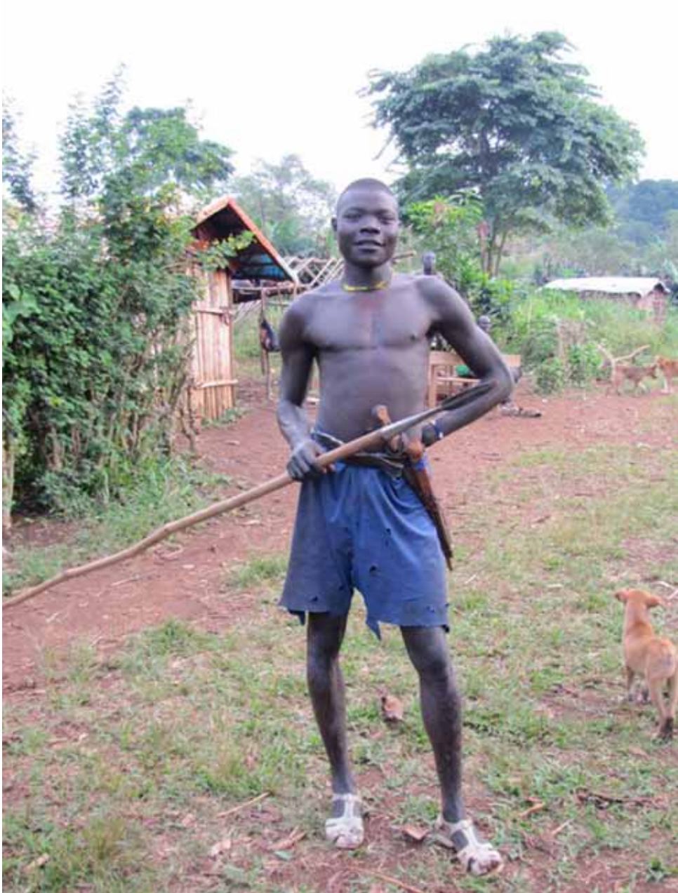
Figure 2 Chabu man with spear, dog, and fire starting kit on waist